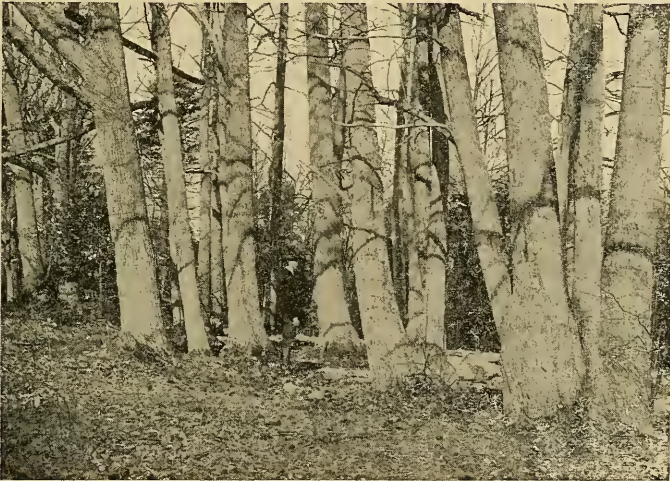
FOREST NEAR AMHERST